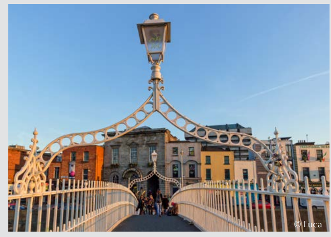
Ha'Penny Bridge (Dublin)

Accommodations are chosen for their charm and proximity to the sites we visit. Average temperatures in September range from the mid-60s F during the day to the mid-40s F at night, with a fair chance of precipitation. Complete pre-departure details will be sent to participants.