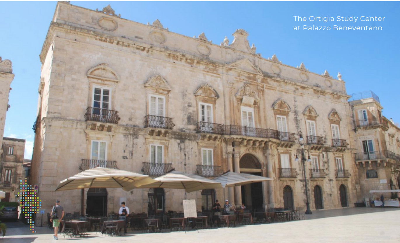
The Ortigia Study Center at Palazzo Beneventano

Located on the island of Ortigia, in the 14th-century Palazzo Beneventano del Bosco, set in the most charming square in the city, Piazza Duomo. The late-baroque style palazzo faces the Municipio (Town Hall) and the Duomo (Cathedral), both of which were erected on the ruins of two Greek temples. The Piazza Duomo square sits on the site of the ancient Greek city's acropolis, bearing witness to which is the majestic doric colonnade on the northern side of the cathedral.