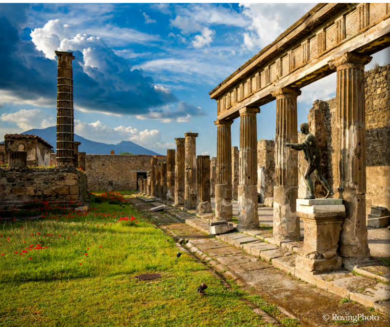
Pompeii with Mt. Vesuvius in the background