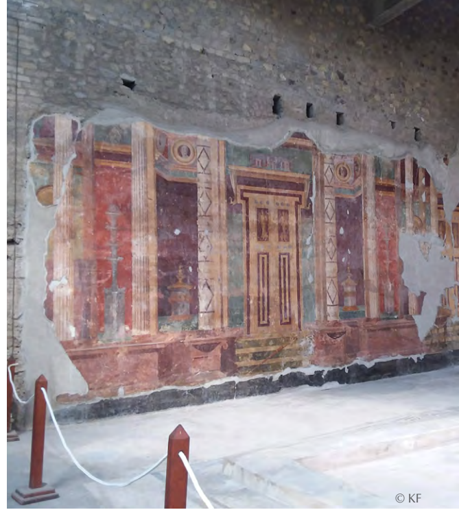
Wall painting inside the villa of Oplontis