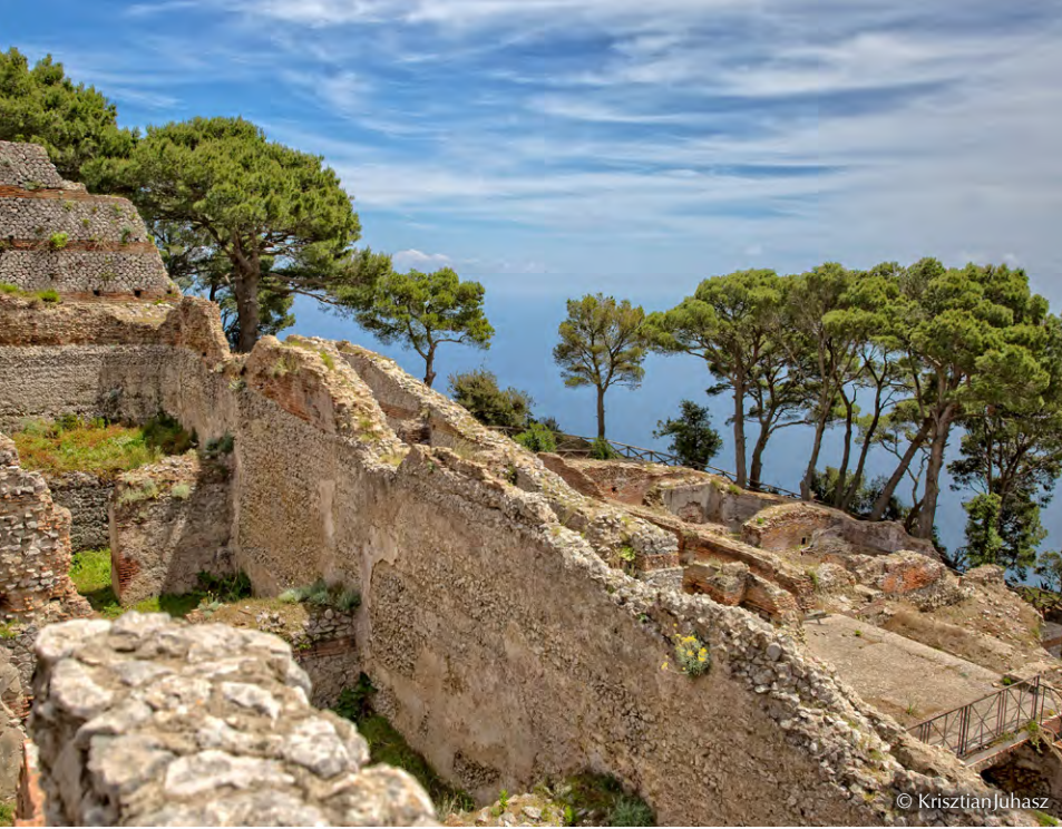
Villa Jovis, one of twelve ancient Roman villas on the island of Capri