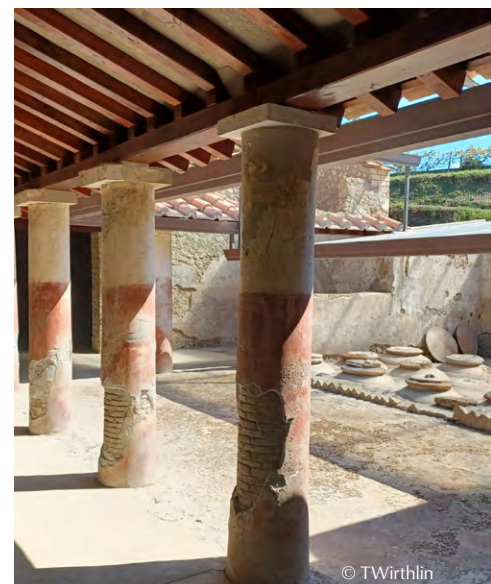
Villa Regina at Boscoreale