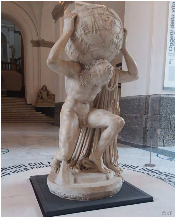
Naples Archaeological Museum

Reserve your space before November 1, 2026 & SAVE $500 PER PERSON