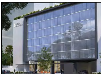
LIMA: Four nights total at the 5-star Hotel Indigo Lima Miraflores