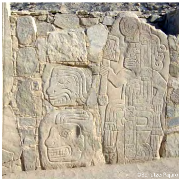
Two of the more than 300 carved bas-reliefs at Sechín