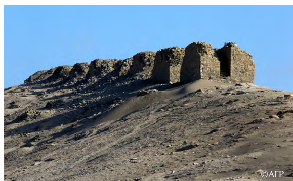
Some of the thirteen towers at Chankillo