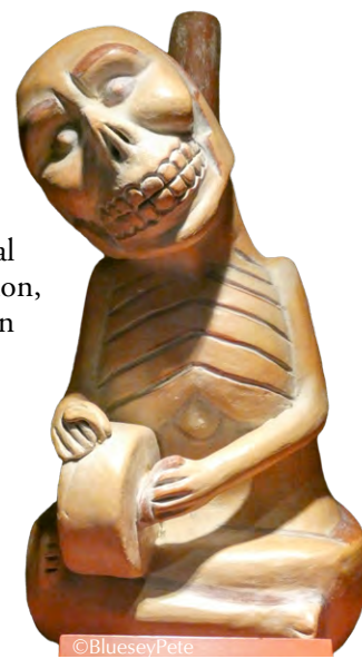
Moche Ceramic at the Royal Tombs of Sipán Museum

Today we travel to the Moche Valley to explore the cultural heart of one of Peru's most influential ancient civilizations, Huacas del Sol y de la Luna archaeological complex, the ceremonial center of the Moche civilization, which flourished between A.D. 100 and 900. We begin with a tour of the site museum, where we gain insight into the Moche's sophisticated society, symbolic art, and religious traditions. We then explore the Huaca de la Luna, a truncated pyramid built between the 1 st and 7 th centuries A.D. It is particularly renowned for its polychrome friezes, which depict gods, elements of nature, and scenes of human sacrifice. After lunch in Huanchaco, we explore the legacy of the Chimú Kingdom, whose capital city, Chan Chan, reached its height in the 15 th century before being conquered by the Incas. As the largest pre-Columbian city in the Americas and a UNESCO World Heritage Site, it is renowned for its meticulous urban planning, reflecting an advanced political and social structure. Its monumental zone includes nine large palatial compounds, adorned with intricately carved adobe walls. We return to Trujillo and enjoy an independent dinner this evening. (B,L)