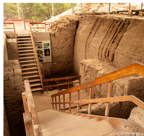
Reconstruction of the tomb of the Lord of Sipán

"Sipán is the most amazing site, the museum is simply spectacular, the visitors can understand the Moche culture very deeply."