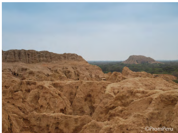
Batán Grande archaeological complex, Pomac Forest