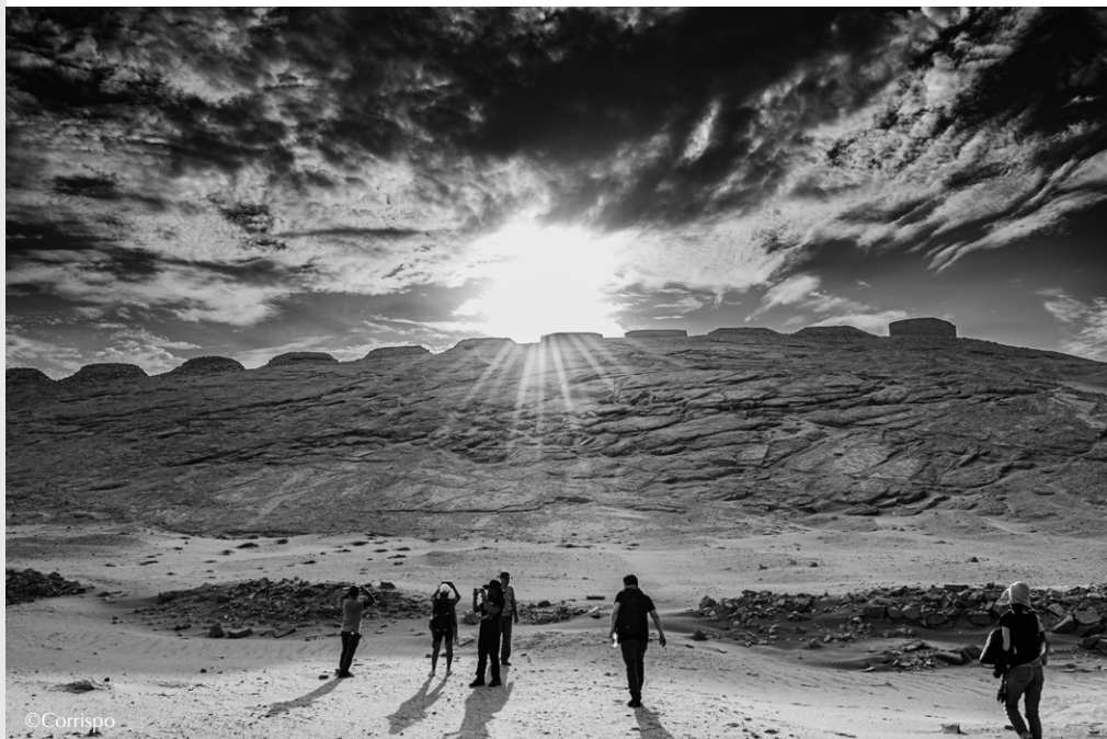
The thirteen towers at Chankillo stretch across a ridgeline, forming an artificial horizon that allowed ancient sky watchers to track the movement of the sun with extraordinary accuracy.