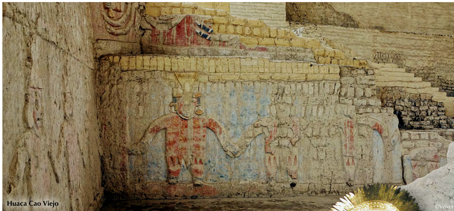
Huaca Cao Viejo

Begin the day with a visit to the Royal Tombs of Sipán Museum, which displays artifacts from the significant Sipán excavations (Huaca Rajada), where archaeologist Walter Alva's 1987 discovery of the Lord of Sipán's tomb revolutionized archaeology, and today hosts the remains and treasures of the tomb's esteemed Moche-era warrior priest in a captivating permanent exhibition. After lunch, we visit Huaca Rajada, the actual tomb of the Lord of Sipán, located just outside Sipán village. This archaeological site comprises three pyramids with 14 separate tombs and chambers, showcasing hierarchy and importance. Dating back to A.D. 100, a millennium before the Inca Empire, the site's miraculously intact tomb has escaped the clutches of local huaqueros (grave robbers). Return to Chiclayo for dinner at a local restaurant. (B,L,D)