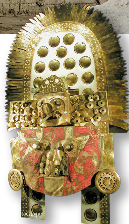
Funerary mask of the Lord of Sicán, Sicán Museum

Transfer to Lima's Jorge Chávez International Airport (LIM) for flights homeward or join the group flight to Cusco for the post-tour extension. (B)