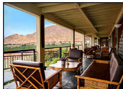
CARAL: Two nights at the 3-star Hotel La Empedrada Ranch & Lodge by Casa Andina