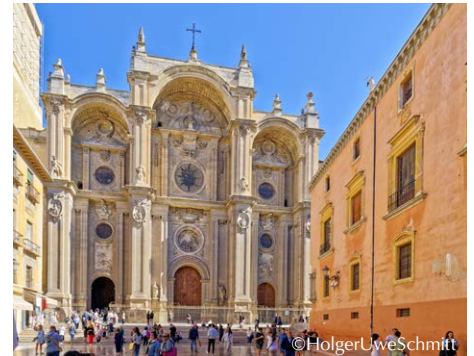
Granada Cathedral, Spain