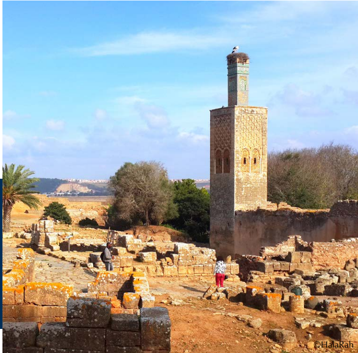
Chellah Fortress, Rabat, Morocco

Reserve your space before April 15, 2026 & SAVE $500 PER PERSON