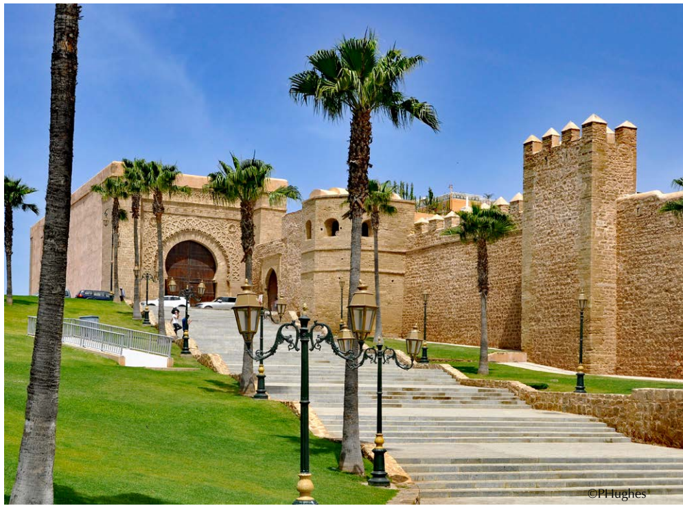
Udaya Gate, Rabat, Morocco