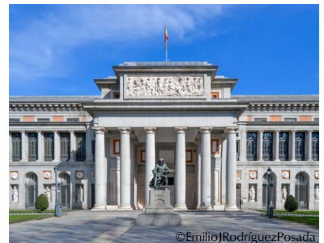
Prado Museum, Madrid, Spain