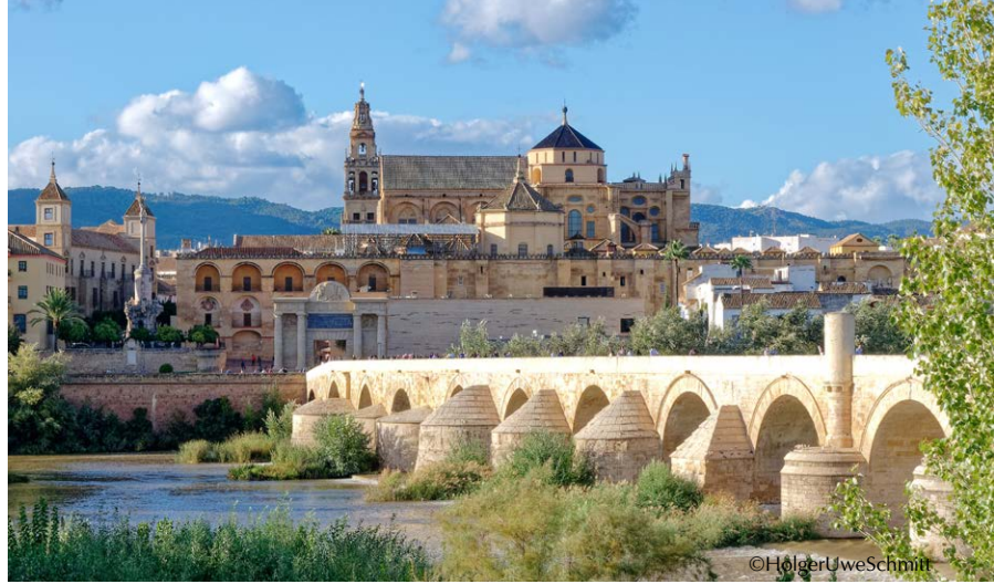
Roman bridge leading to Córdoba, Spain

This morning, we depart early for Madrid, driving approximately 4 ½ hours with a stop along the way for a coffee in the village of Consuegra to see the famous windmills and its castle. Once we arrive in Madrid, check-in to our hotel, freshen up from our