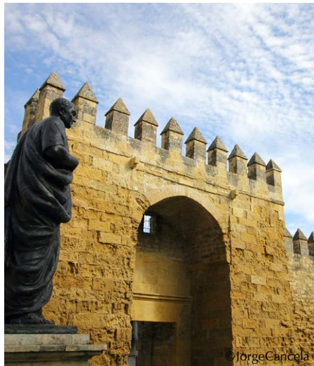
Almodóvar Gate, Córdoba, Spain