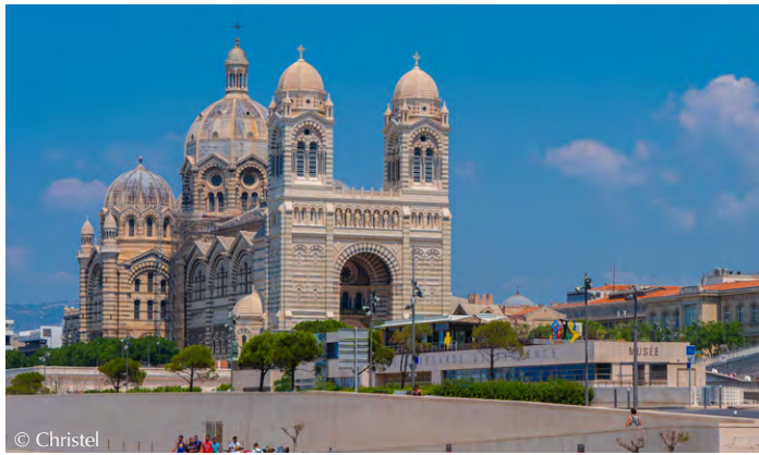
Marseille Cathedral behind Cosquer Méditerranée, Marseille