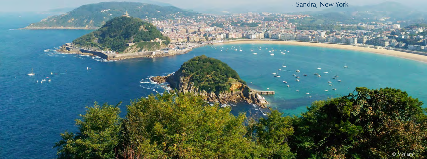
San Sebastián, on the Bay of Biscay