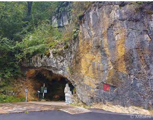
Entrance to Isturitz & Oxocelhaya Caves