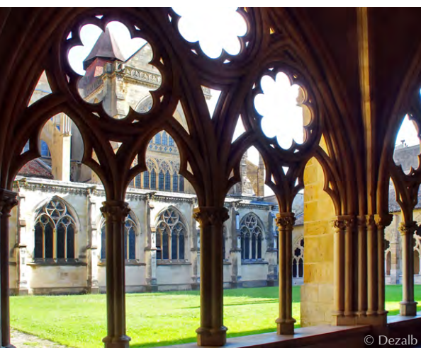
Cathedral of Sainte-Marie, Bayonne