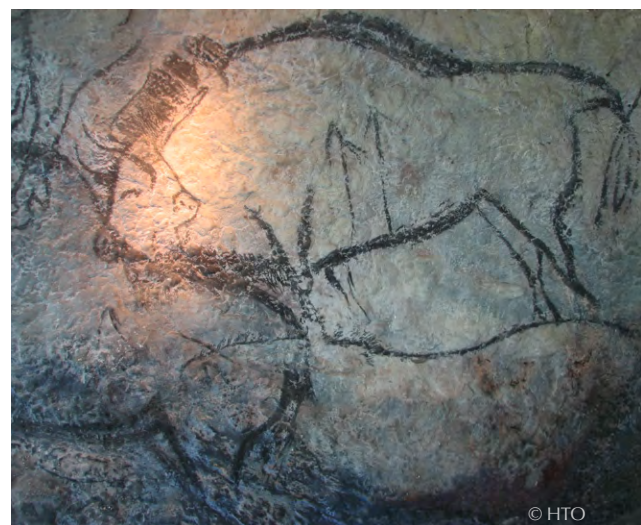
Painting of bison from the Salon Noir of Niaux Cave

Cover: (left, from top) Chauvet Cave, negative hand prints at Gargas Cave; (right) Entrance to Mas d'Azil cave