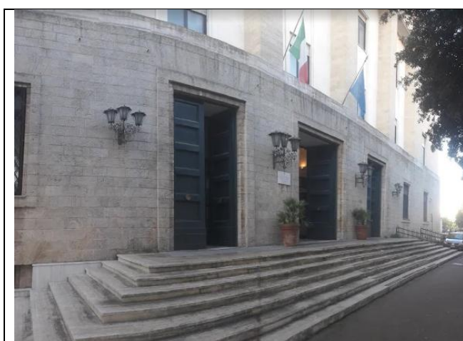
Figure 1: Main entrance to the Lecce Chamber of Commerce/Camera di Commercio di Lecce

Students will be met on the first day of the field school (Sunday), 5:00pm at the Lecce Chamber of Commerce/Camera di Commercio di Lecce ( Viale Gallipoli 39, 73100 Lecce, Italy )(Fig 1). The building is a six minutes' walk from Lecce main train station (Fig 2).