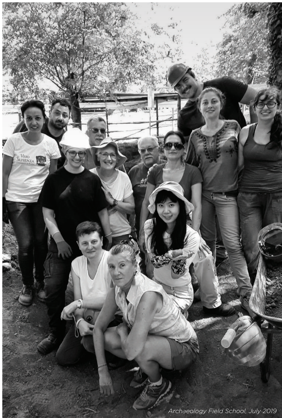
Archaeology Field School, July 2019