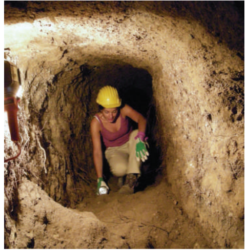
Top: Archaeologist exploring a tunnel in a tomb. Bottom left: Three stone sarcophagi inside a tomb near Tuscania, 3rd - 2nd cent. Bottom right: An unviolated tomb with multiple graves with their goods and human remains, 3rd - 2nd cent. BC.