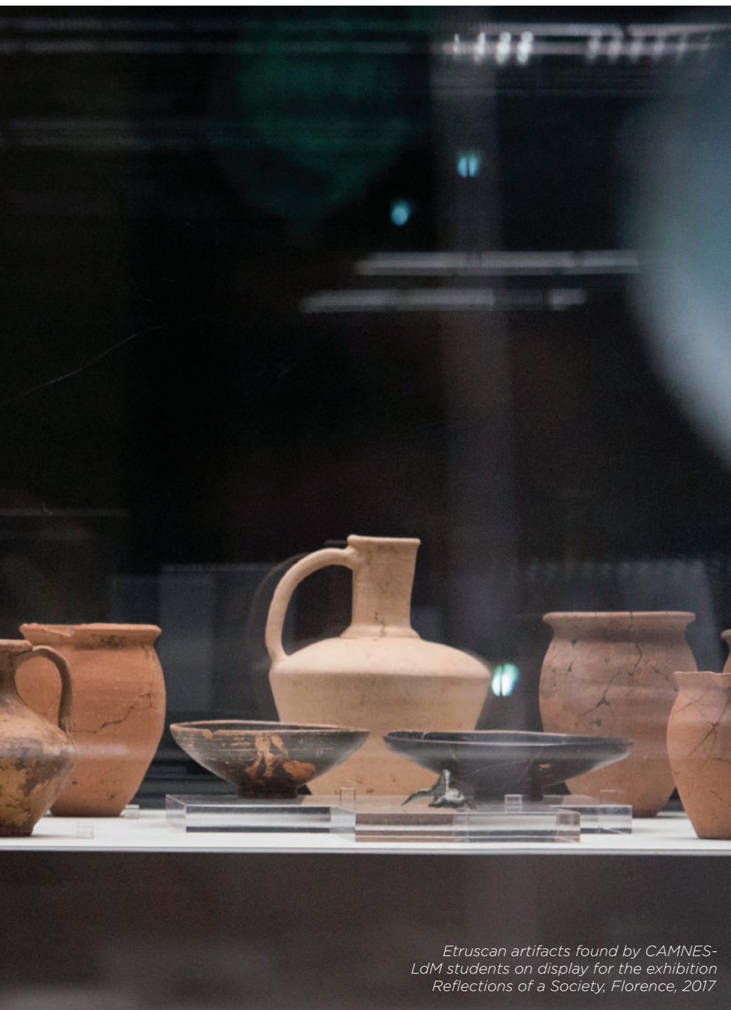
Etruscan artifacts found by CAMNES- LdM students on display for the exhibition Reflections of a Society, Florence, 2017