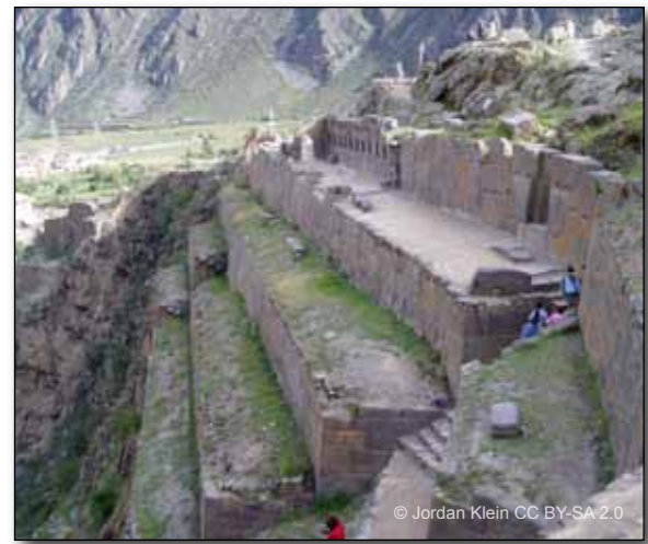
Above, terraces of the Ollantaytambo ruins. Below, Machu Picchu. Bottom, an AIA traveler at Sacsayhuaman in 2016.

Transfer this morning to the Cuzco airport for our group flight to Lima, connecting to independent flights homeward. (B)