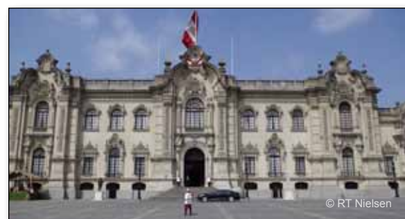
Above, the National Palace, Lima. Below, Huaca del Sol. Bottom, frescoes beside the tomb of the Señora de Cao.