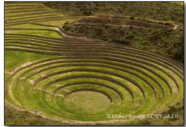
Above, circular terraces at Moray. Below, reconstruction of the tomb of the Lord of Sipán. Bottom, the Ollantaytambo ruins.